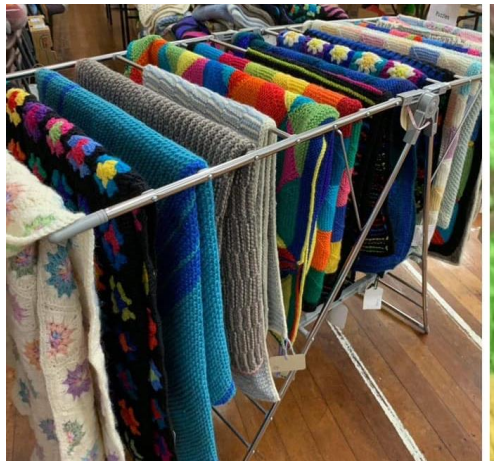
Winter warmers 2023