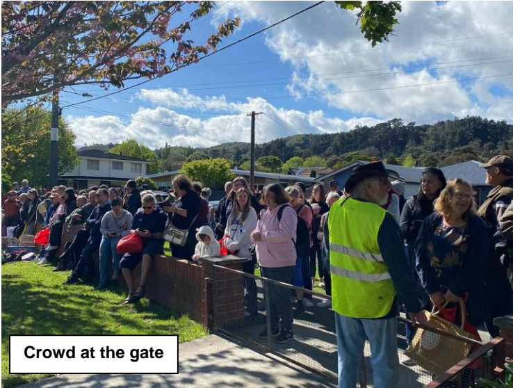
Crowd at the gate