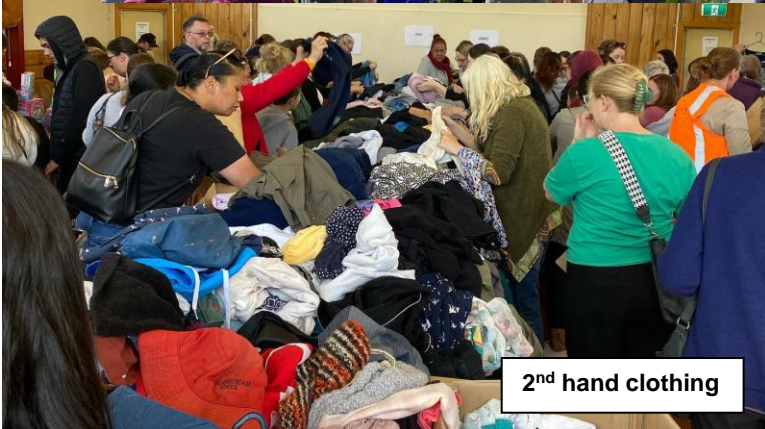
2 nd hand clothing